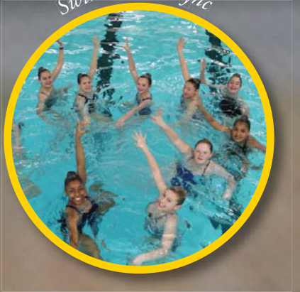
Swimming in sync