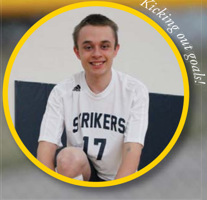
Kicking out goals!