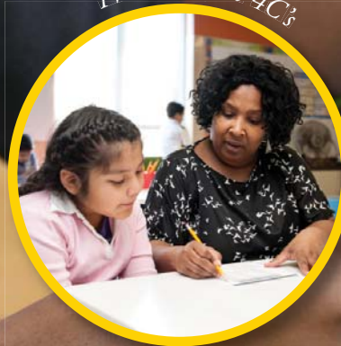
Practicing the 4C's