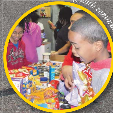
Partnering with community